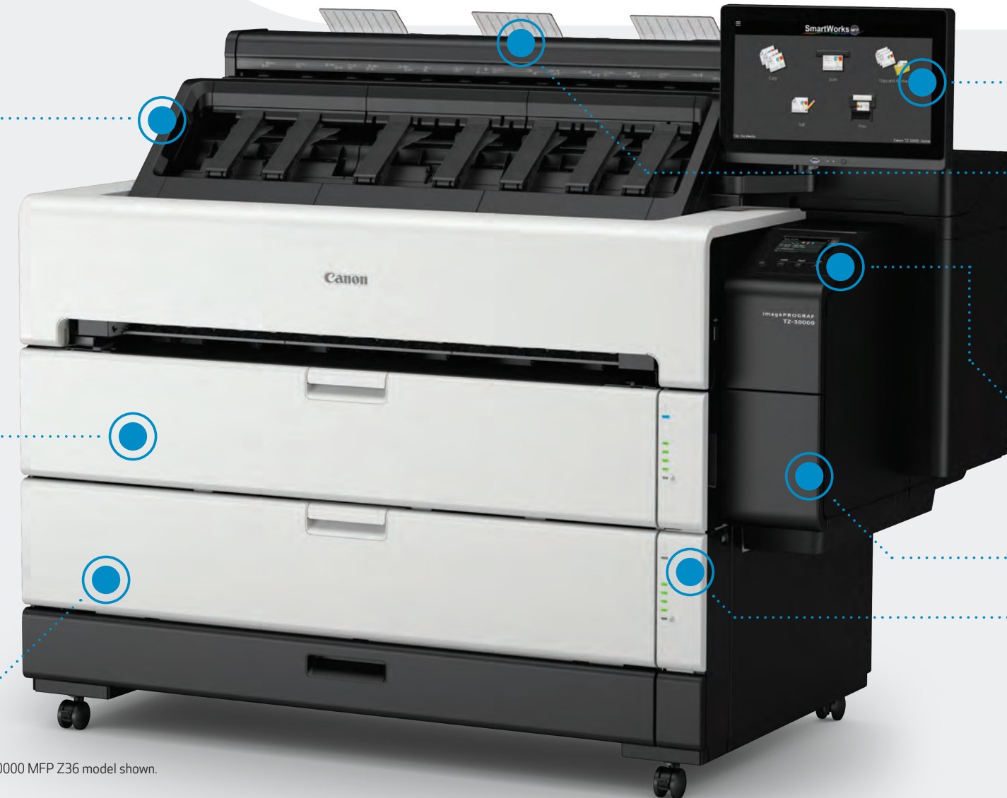
TZ-30000 MFP Z36 model shown.

The MFP System Controller has an all-new intuitive GUI design for simplified printer management. Complete with a new processor, scanner functionality has never been easier and faster in an imagePROGRAF MFP.